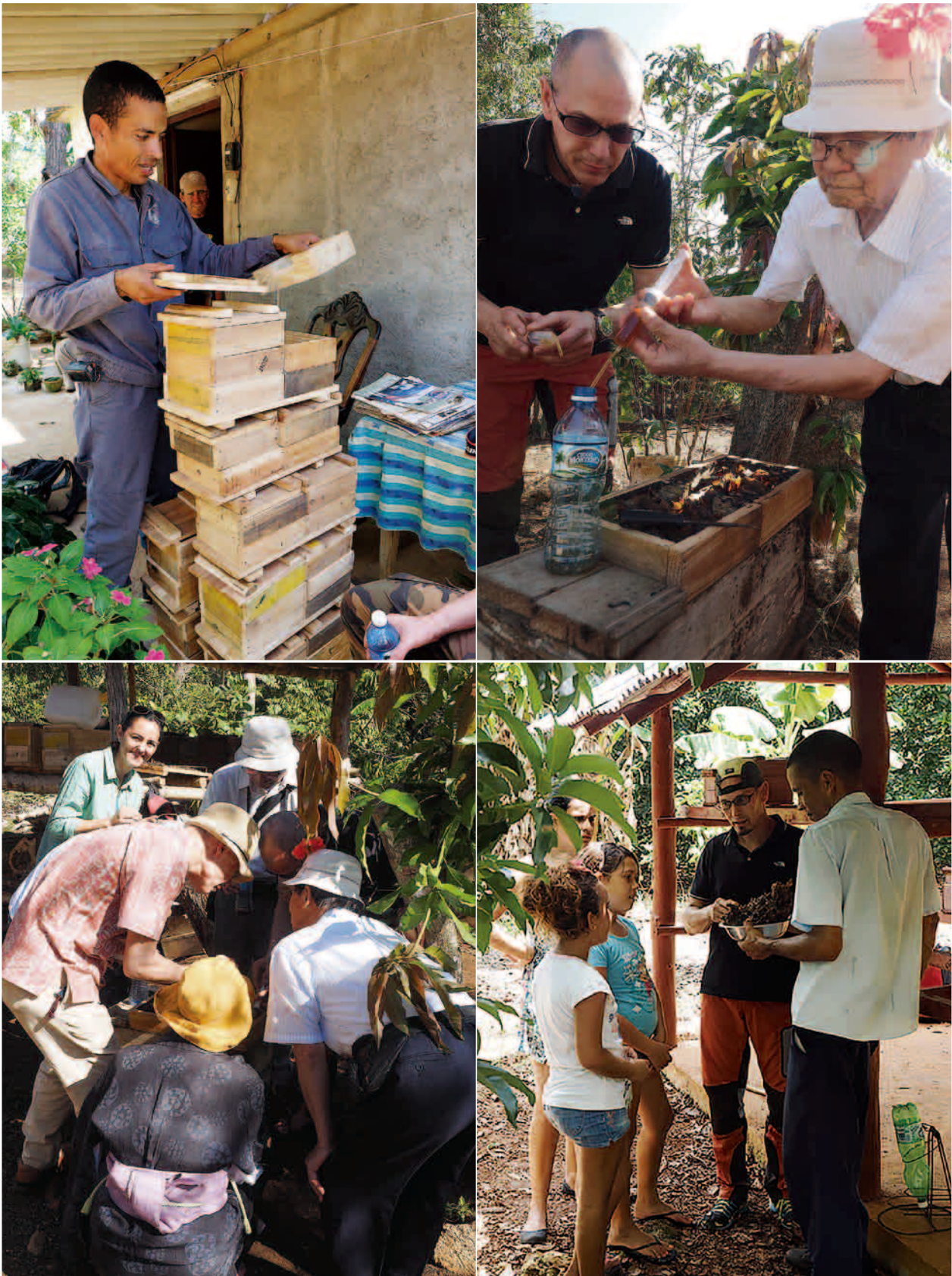
Figure 3: Top-left: Melipona beecheii boxes being prepared to distribute across farmlands around Pio Cua community. Top-right and bottom-left: Sharing the experience of stingless bee honey extraction. Bottom-right: Teaching children in the community about stingless bees and their roles as pollinators.