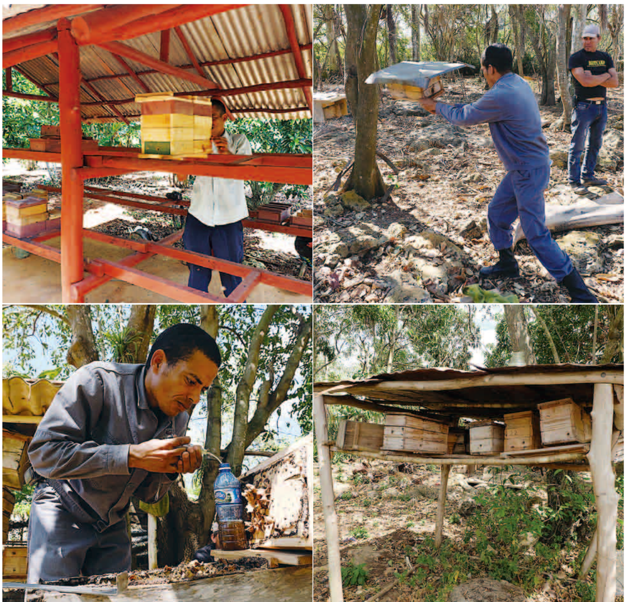
Figure 2: Top-left: Melipona beecheii hives placed in a farmland field of guaba fruits for touristic uses. Top-right: Placing M. beecheii hives around in a farmland. Bottom-left: Traditional stingless bee honey extraction using sterilized syringes. Bottom-right: M. beecheii hives kept for honey production at different locations around Pio Cua community.